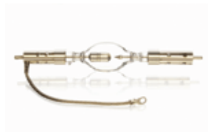
Philips LTIX 4500W Short lamp