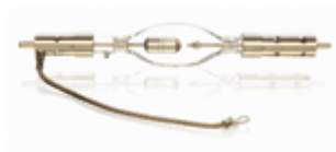
Philips LTIX 4202W Short Helios